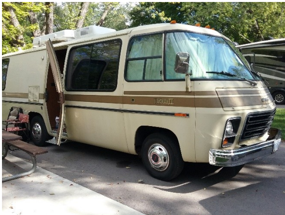
1976 Eleganza II